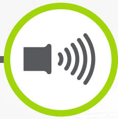
INTELLIGENT DOOR SENSOR