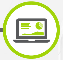
POWER IQ DCIM SOFTWARE